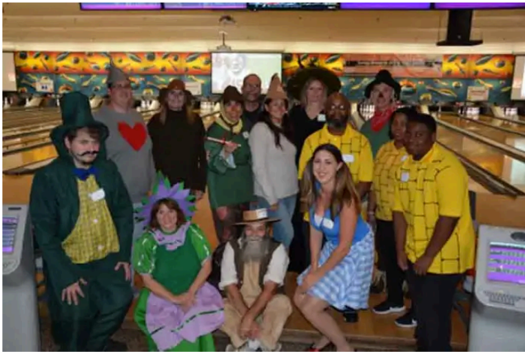
Tiffany & Co. volunteered at the event, making sure it was a success